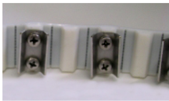
handle and grinding blades are available as spare parts